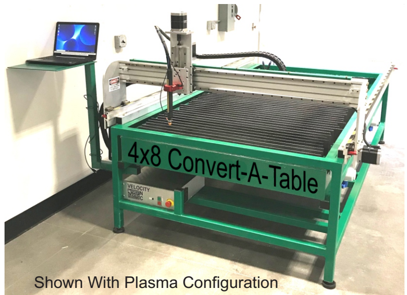
Shown With Plasma Configuration